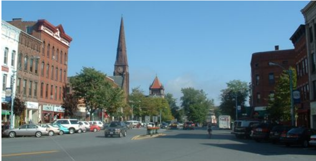
Figure : Downtown Northampton: photo credit Mr Weeeee

Committee for entranceway signs to the City, and because he could address all of the wayfinding elements brilliantly. The fact that he offered to do the price at significantly below market and take the risks of cost overruns was an added benefit.