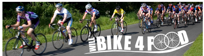
Figure : Riders from the 2011 fundraiser

tion on last year's ride at http://www.foodbankwma.org/events/bike/registration/ and see photos from 2011 at http://www.foodbankwma.org/events/will-bike-4-food-2011-photos/ .