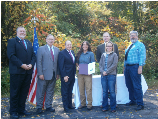
Announcement of grants to fund trail projects in Williamsburg