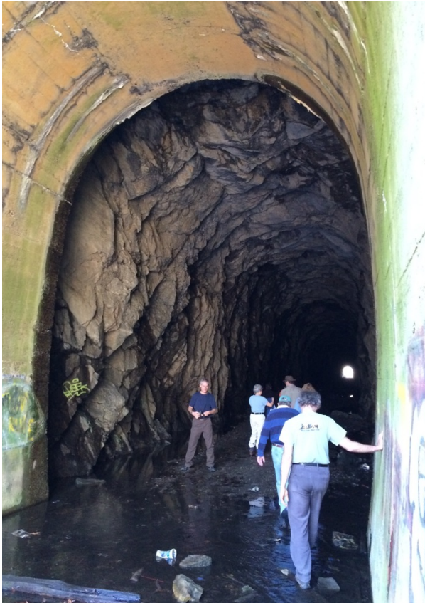
A tunnel entrance on the Mass Central Rail Trail in Clinton