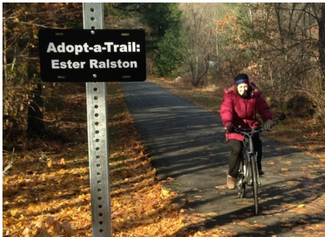
Adopt-a-trail sign in Northampton

The City of Northampton has created an Adopt-a-Trail program for all City rail trails. Volunteers, individuals or groups, are responsible for a short segment