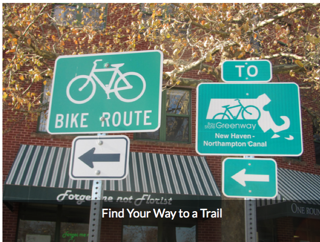
Signs along the trail

We are once again joining with other nonprofits in the Pioneer Valley for Valley Gives, a 24-hour celebration of giving to be held on December 10. Not able to participate on December 10? Gifts made as early as Monday, December 1 may be scheduled to be effective on Valley Gives Day, December 10; go to the FNTG Valley Gives page at http://www.razoo.com/story/Friends-Of-Northampton-Trails-And-Greenways and click on the Donate box. Already donated this year? Visit the FNTG Valley Gives page anyway. Perhaps you'll be inspired to give a little extra to support our work.